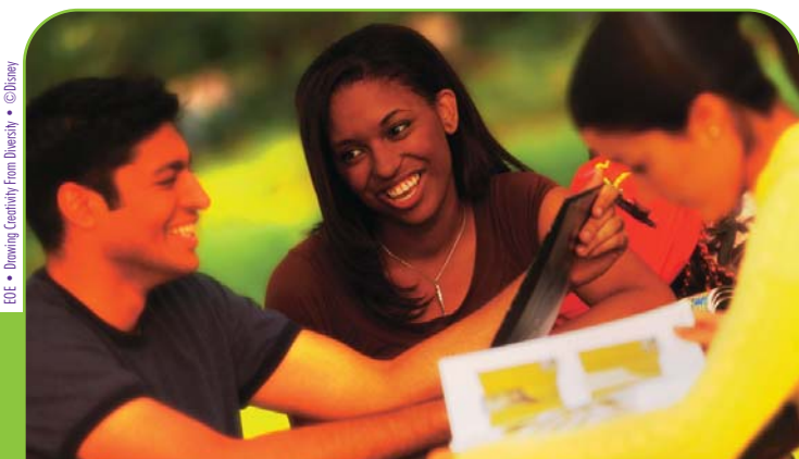
EF • Drawing Creativity From Diversity • ©Disney