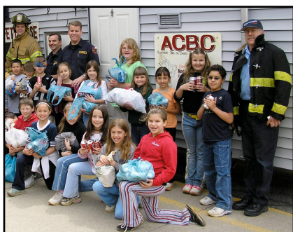
Students donate cans to return the favor when the fire dept. visits for a safety lesson.

“I’ve tried to make my classroom a place children want to be. It is a safe room, where fear of the teacher isn’t the motivator. It’s a place where on any given day there may be a variety of active, interesting lessons and if you miss the day you probably missed something good.